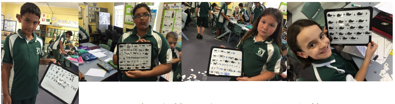
Students building number sentences using animal legs.